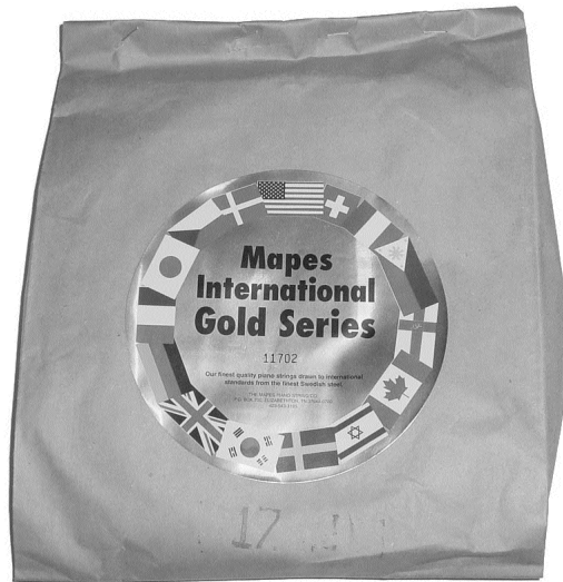
Mapes International Gold Series Music Wire